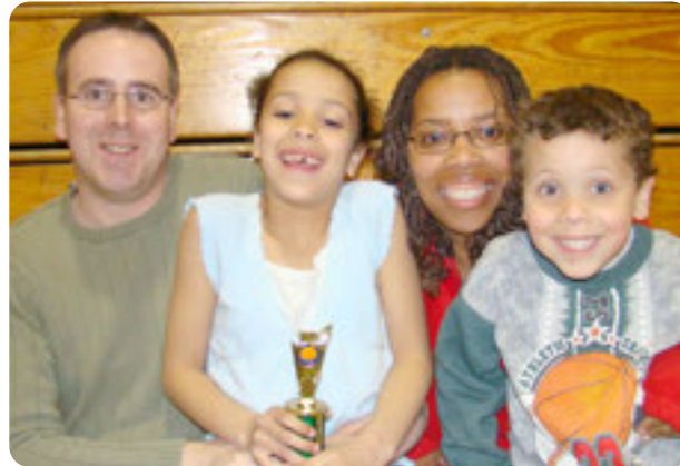
Helping families and kids be all they can be.